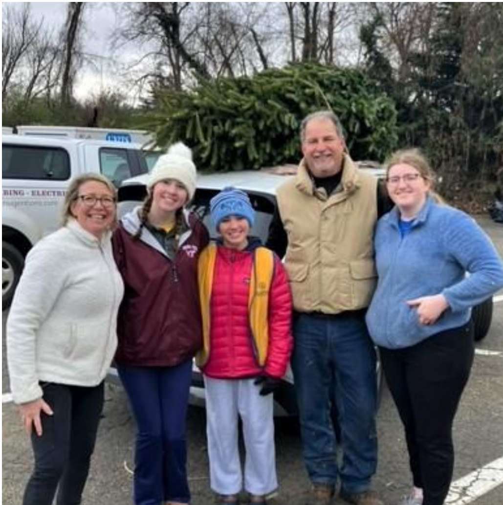
The last tree sold!