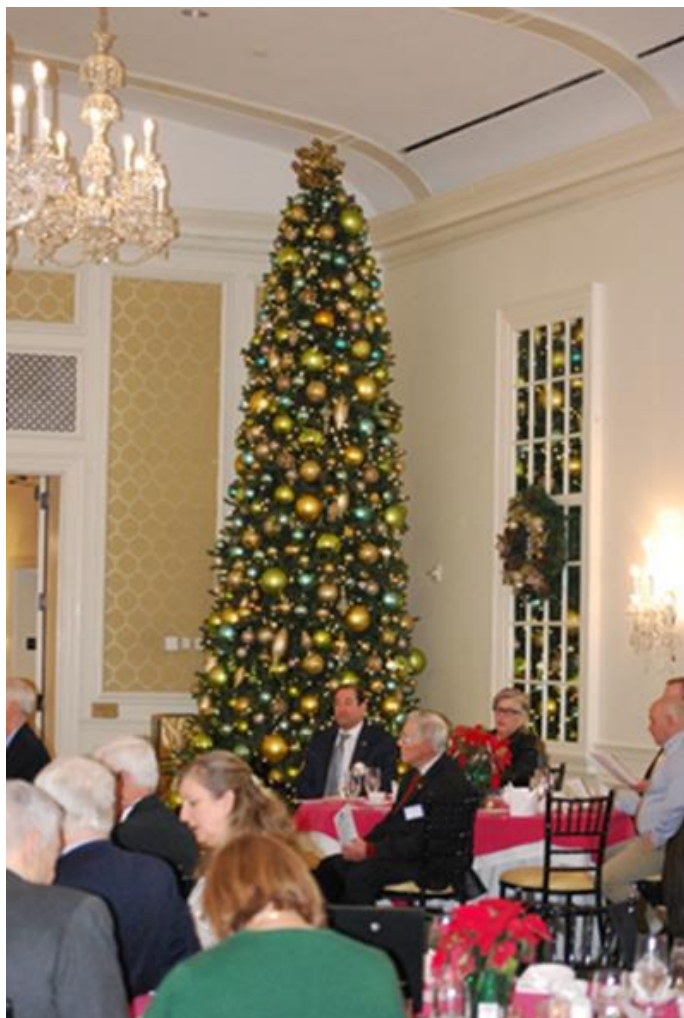
WGCC Christmas tree (not ours!)