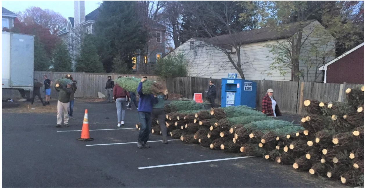
of the Yorktown Crew team unloading trees.