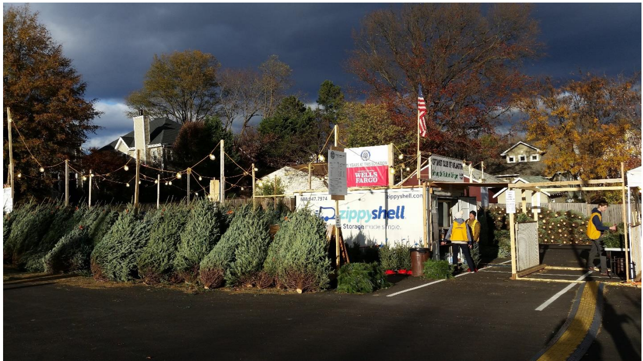
of the first day's sales on Nov. 26.