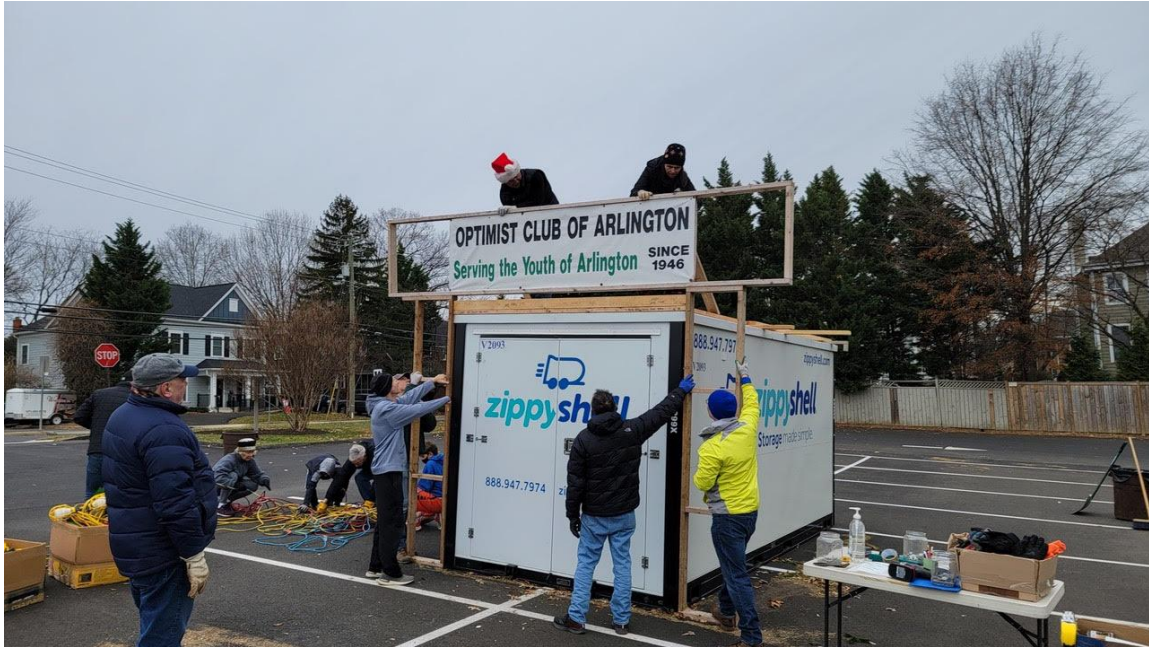
of the final take down on December 19.