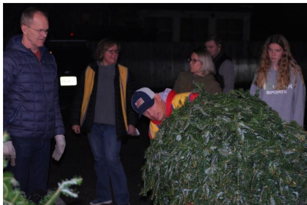
BRBB at work