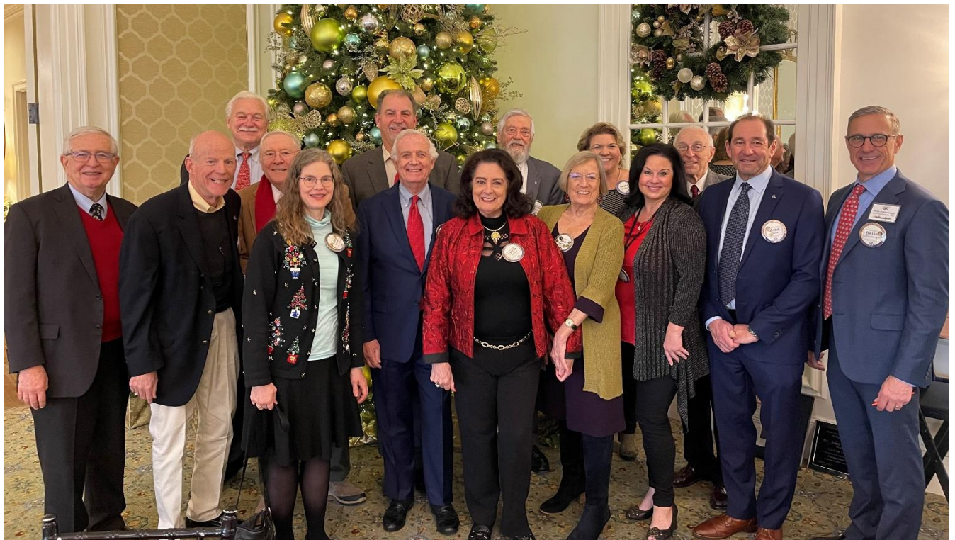
Optimists at the Christmas Breakfast.