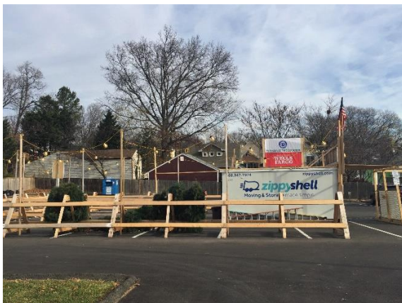
Almost the end (12/7)