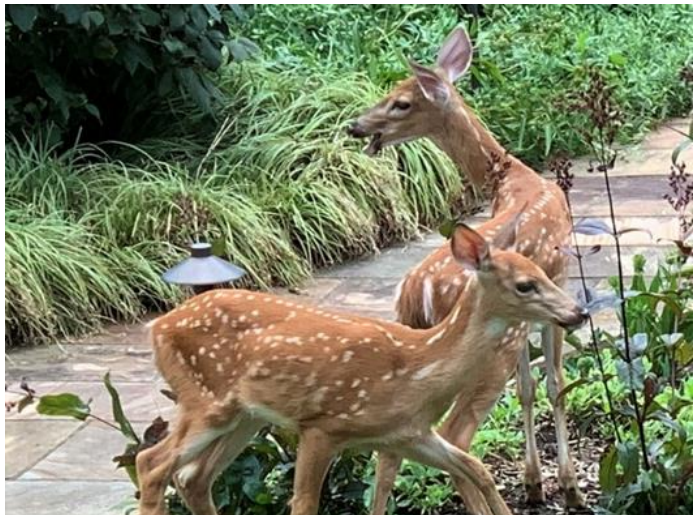
Fawns in Clayton's front yard.