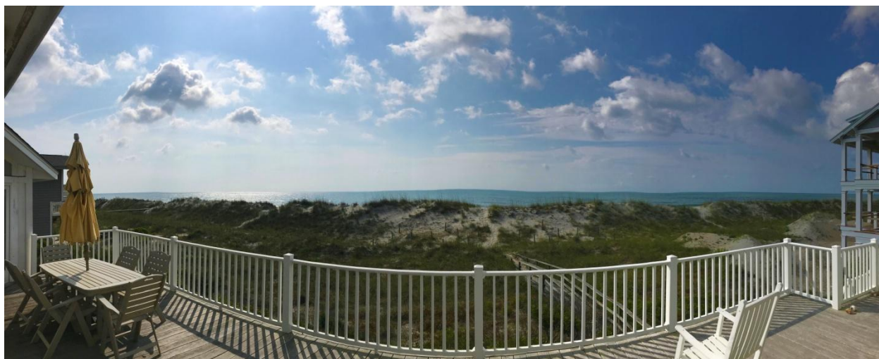
Jeff Englander submitted this photo of the view from their deck on Figure Eight Island.