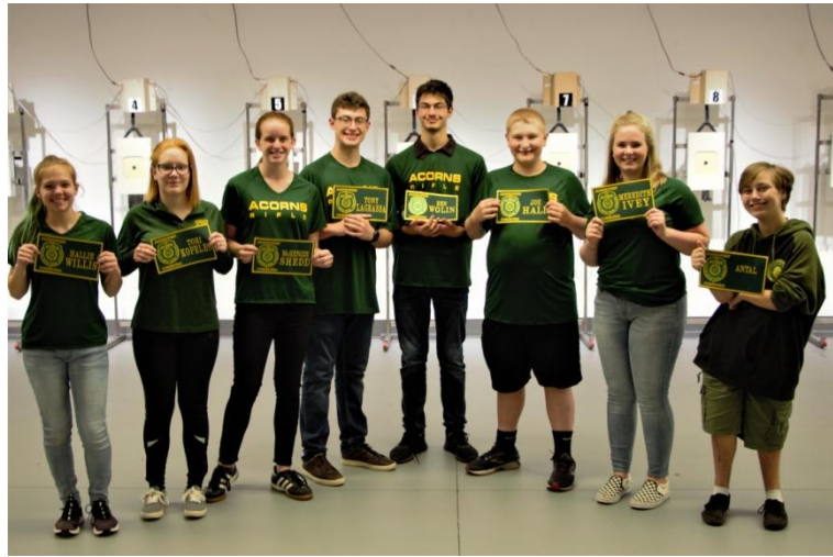
Eight new Acorns this year. Congratulations! Team re-building photo by the Acorns.