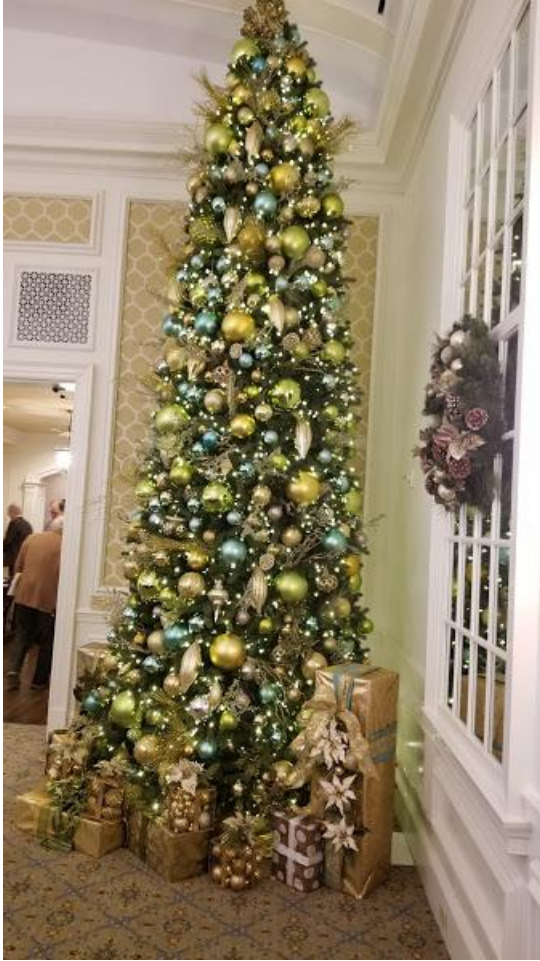
WGCC Christmas tree. [Photo by Erin Mendenhall ].