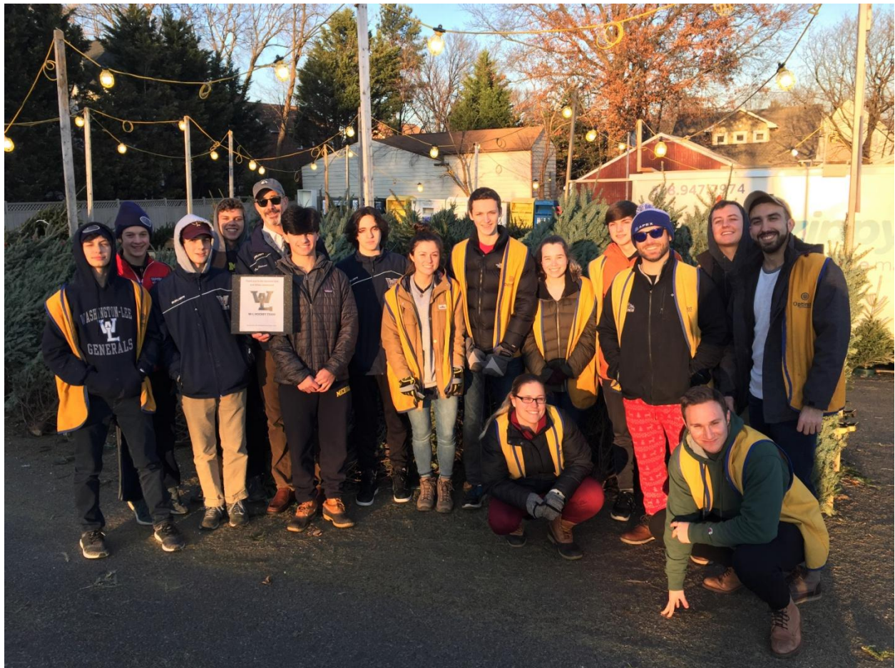
Lot workers on December 11, including W-L Hockey team..