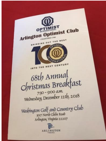
Program photo by Erin Mendenhall .