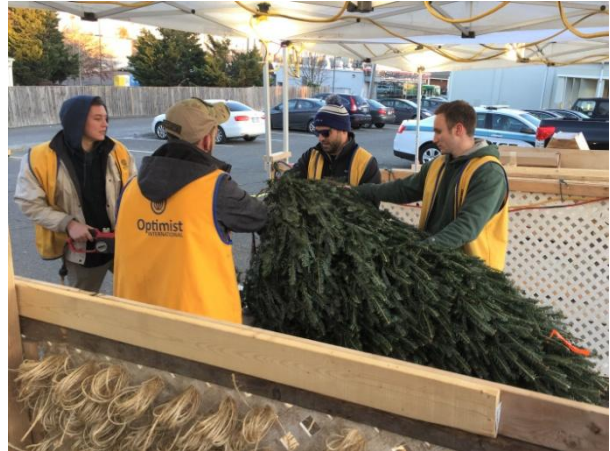
Tree cutting team. [Photo by Clayton Depue ].