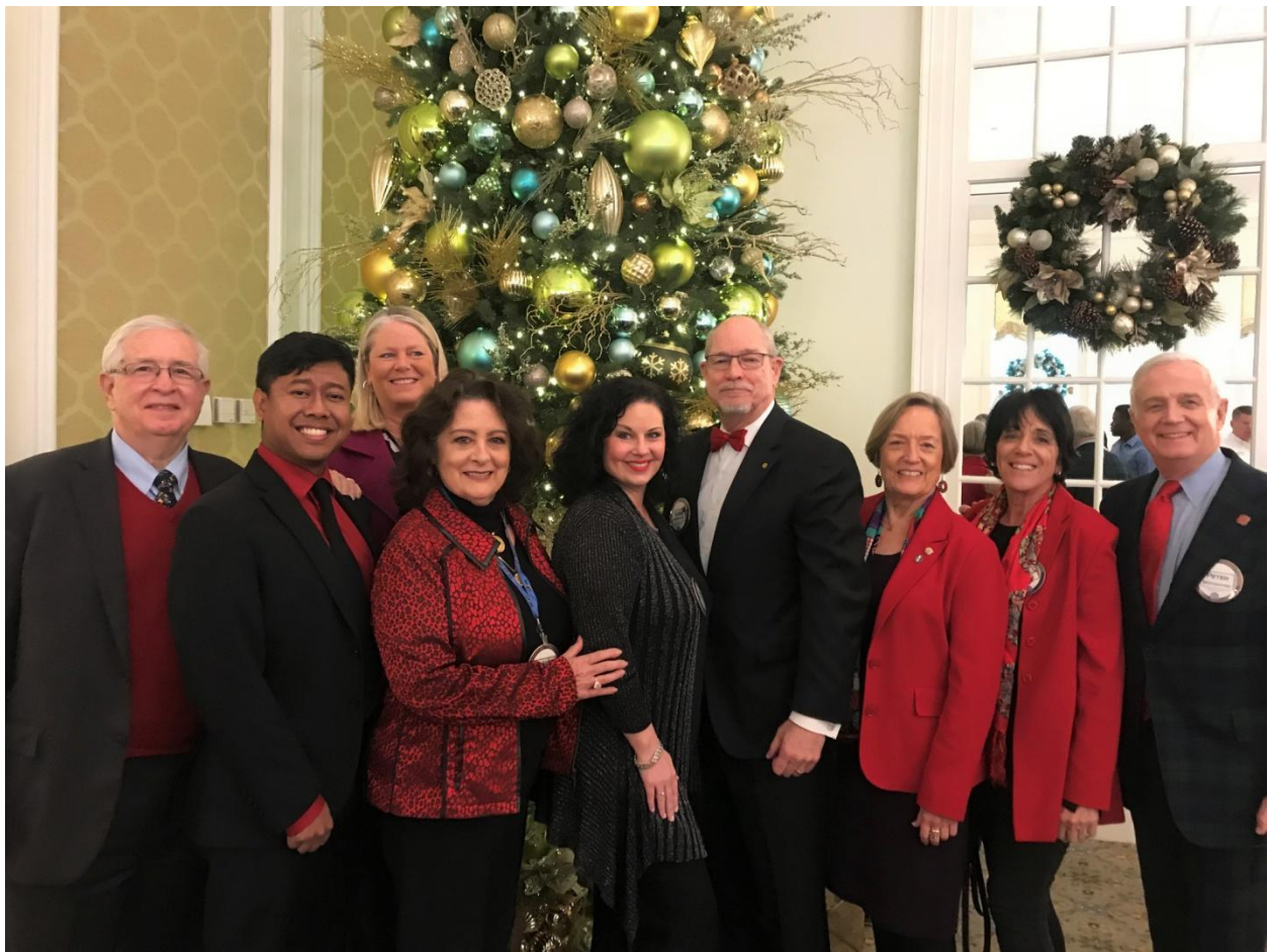
Optimist group photo provided by Erin Mendenhall .