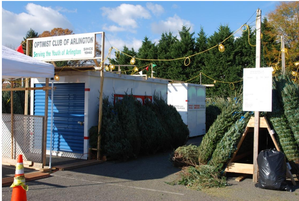
Photo of Tree Lot Construction on November 20, featuring JB Whitlow , Brian Kellenberger , and Greg Clough .

Photo showing the new Annex Pod and stacked trees on November 24: